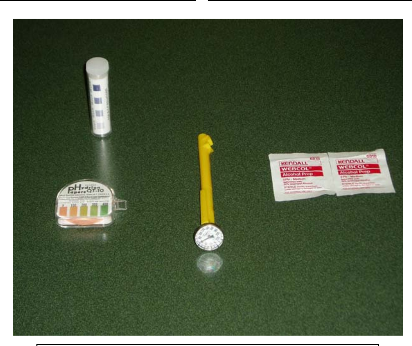
SANITIZER TEST STRIPS, 0-220 °F METAL STEMMED THERMOMETER & ALCOHOL SWABS FOR CLEANING