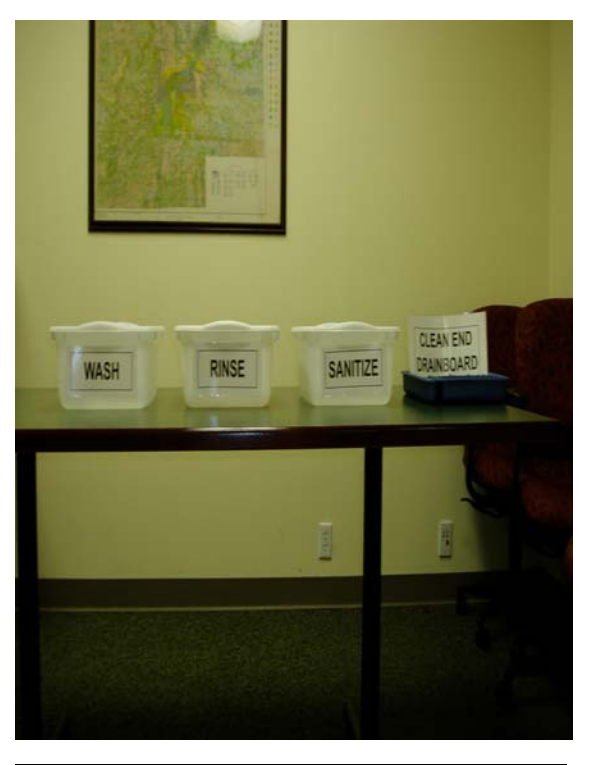
PORTABLE THREE COMPARTMENT SINK WITH AREA FOR AIR DRYING